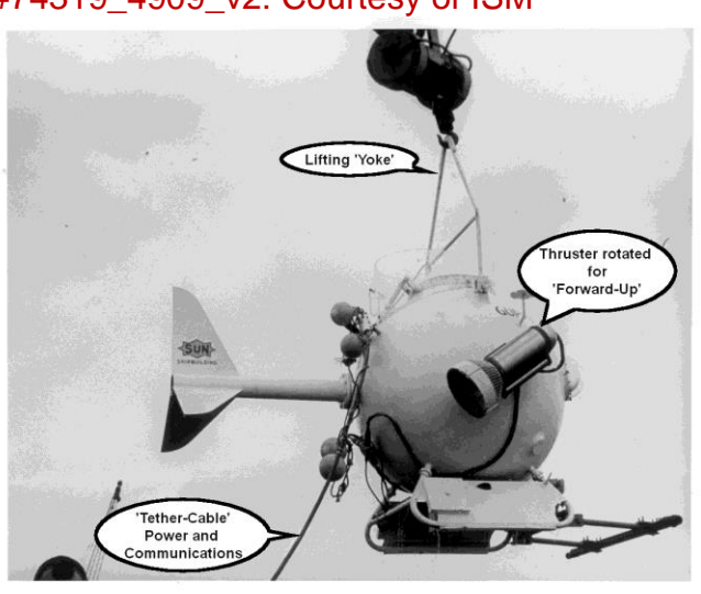
#74319_4909_v2: Courtesy of ISM

We have our 'Data Sheet' on the 'Guppy' at the following location on our website at: