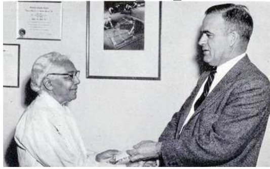
35-Year Service Pin