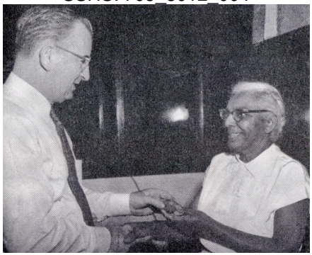
30-Year Service Pin SSHS: 041 30 1a