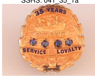
SSHS: SSHS: 041_35_1a