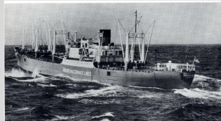
5.6: Delaware County Historical Society Exhibit Notice Photo ID: 705_5502_015cr 8