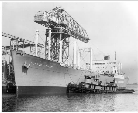
5.4: Photo taken of Sun Ship's CY 'Outfitting Basin' showing L/R: 'MORMACWREN' H-177 at 1-Pier, 'MORMACHAWK' H-176 at 2-Pier South and 'DONALD M c KAY' H-175 at 3-Pier North Photo ID: 74319247r7