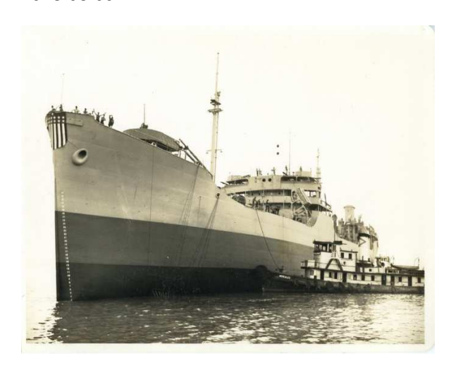
5.6: Seven Pines underway showing ship's armament and transporting planes and cargo on Meccano Deck

5.5: Seven Pines being moved to Wet Dock, after lunching, for 11 days of outfitting prior to delivery on 1943.08.09.